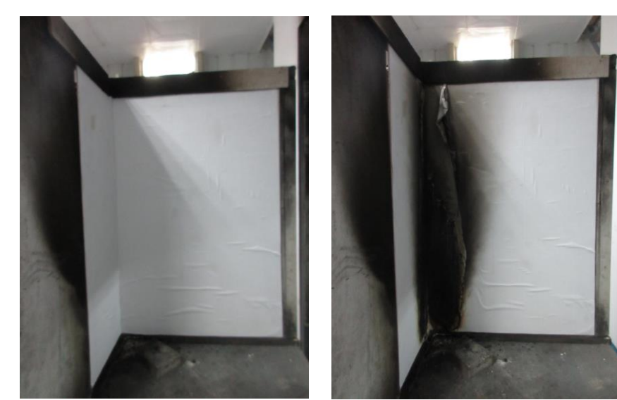
Before Test (EN 13823) After Test (EN 13823) SGS authenticate the photos on original report only Note: The above test was carried out by SGS-CSTC Standards Technical Services Co., Ltd. Shunde Branch. ********* End of report******

Mass per unit area: About 175g/m<sup>2</sup>