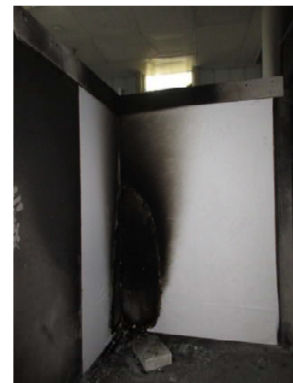
After Test (EN 13823)